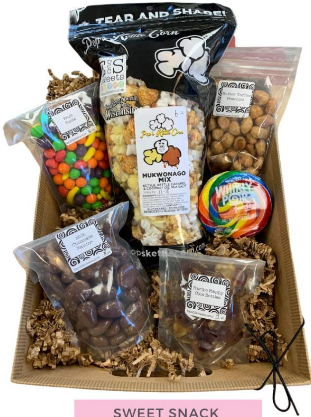
SWEET SNACK PACK ATTACK $30

Celebrate one box at a time with these sets created by our candy experts! With something special for everyone, it's easy to take your gifting to new heights. Available in 2 size options: 9 x 7 x 3" and 12 x 9 x 4"