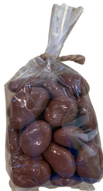
CHOCOLATE COVERED RAISINS