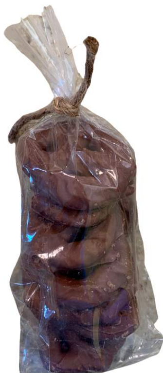
CHOCOLATE COVERED PRETZELS