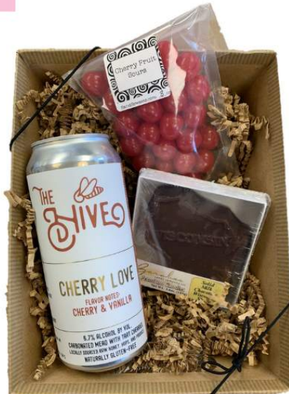
FOR ME, LIFE IS A BOWL OF CHERRIES $25