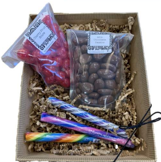
SWEET TREAT $15