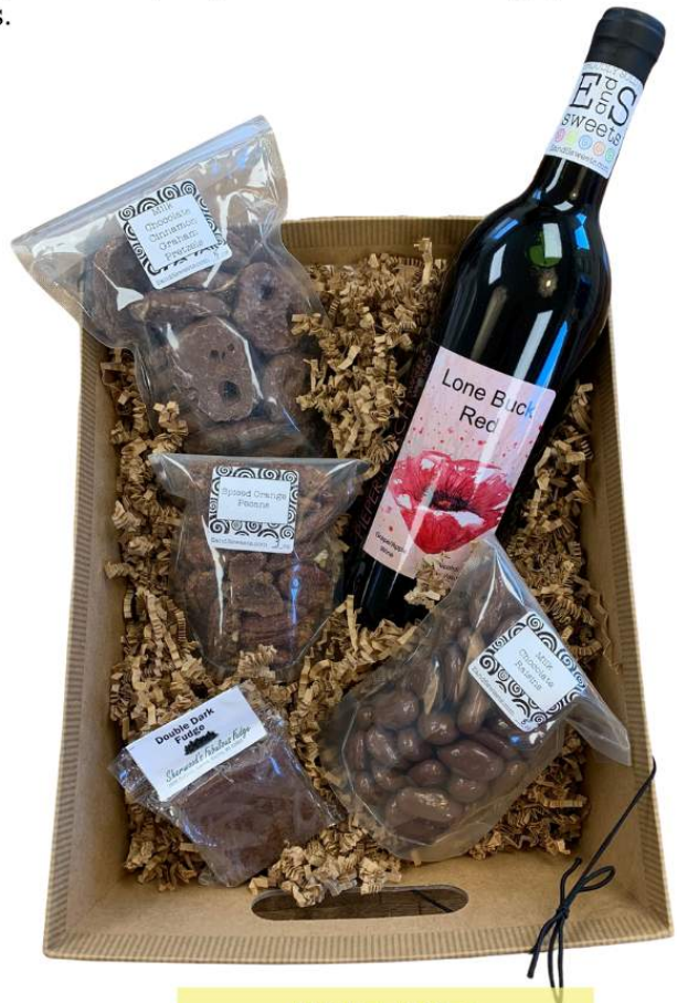
WINE NOT? $45