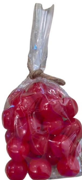
FRUIT SOUR CHERRIES