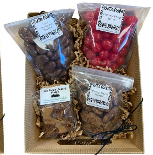
THE SAMPLER $25